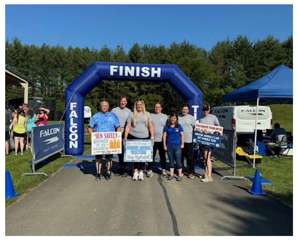
2024 Strawberry Fest 5K, June 13, 2024