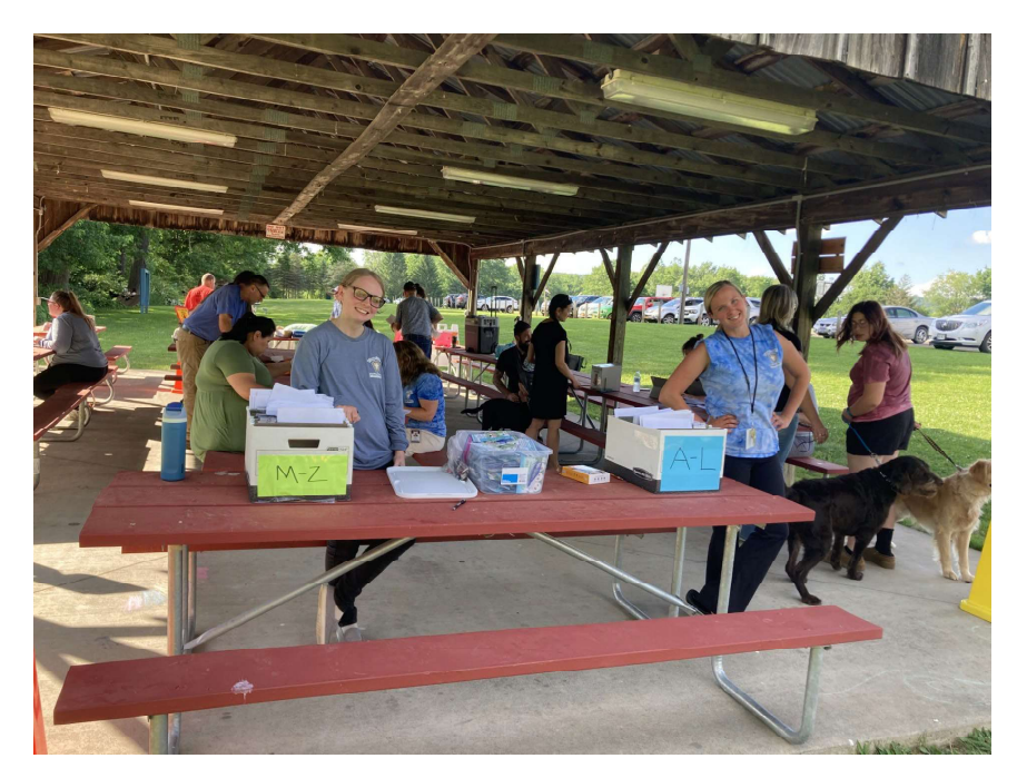
Hickories Park, Owego Rabies Clinic June 6, 2024