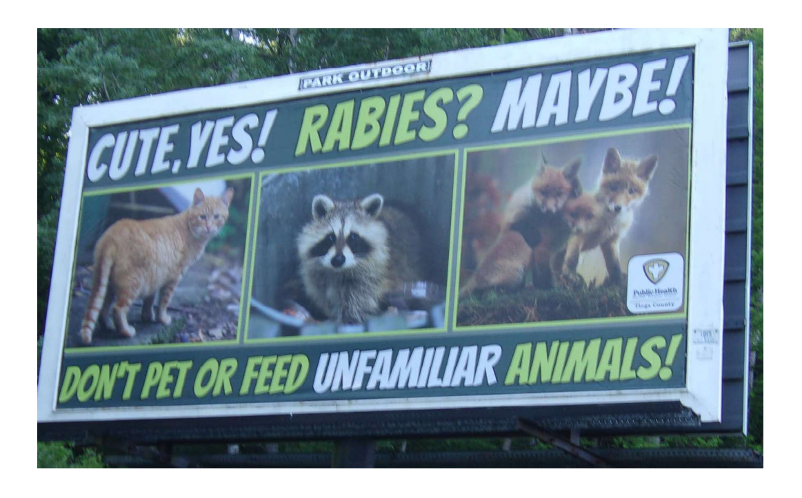
Billboards, Various Locations, June 2024