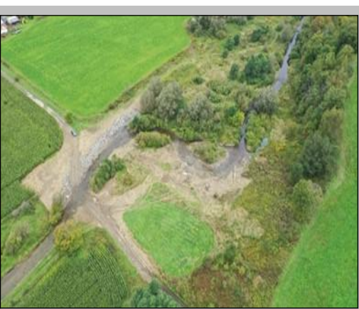
Streambank protection project in Otsego