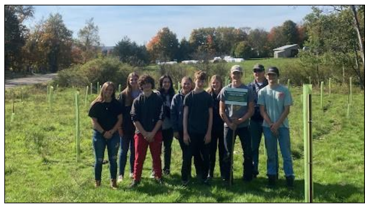
From top Left to Right: Waverly Middle School Science/Ag Class, Owego Free Academy Earth Science/Ag/Horticulture Classes, Owego Free Academy Participation in Government Class, and Newark Valley High School Science/Ag Class.