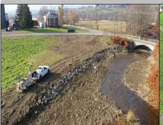
Streambank Protection Project in Cortland County (above)

In partnership with other counties in the Upper Susquehanna region, the district provided engineering support in various counties in 2022. The support includes design, design review, construction oversight, and technical assistance. The photos below show some of the projects that were implemented in 2022. Any other counties in the Upper Susquehanna watershed interested in engineering assistance should contact the district.