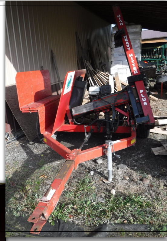
Wheatheard Post Pounder (above) Esch 7' No till Drill (left)

Contact Alex with machine rental and pond questions