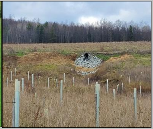
Grade control structures at a road culvert outlet into field in Chemung County (Town of Chemung)