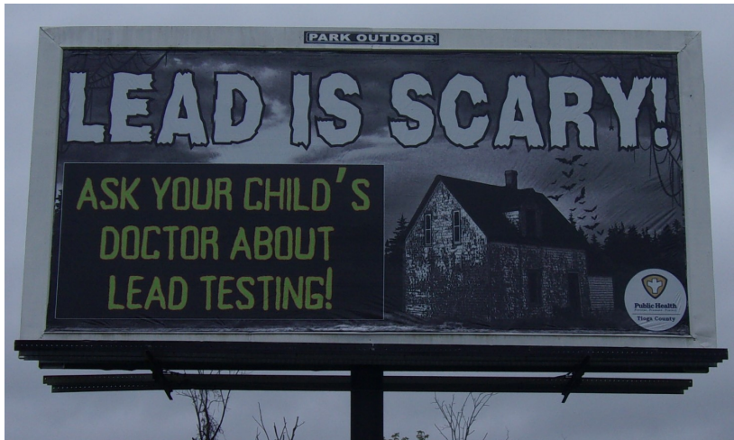
Billboard Design, Various locations, October 2024