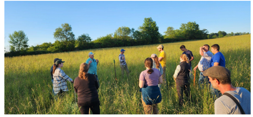
Above: Farmers gather in sheep pasture to discuss parasite control strategies