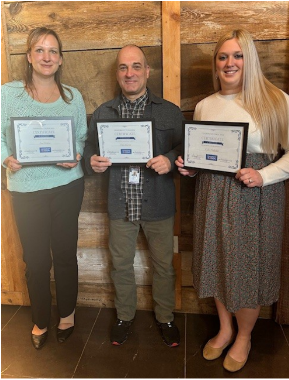
Photo: Leadership Tioga 2024, Public Health Graduates