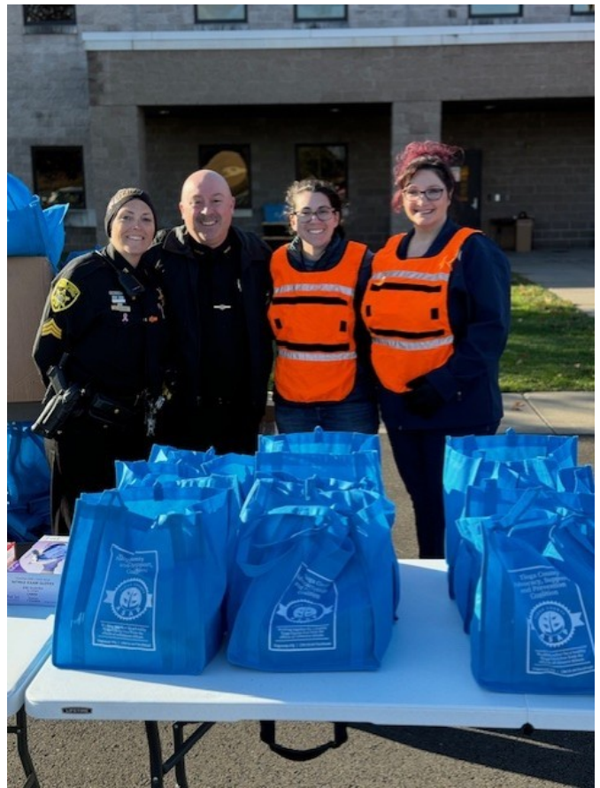
Photo: Drug Take Back Day, Health & Human Services Bldg., Owego