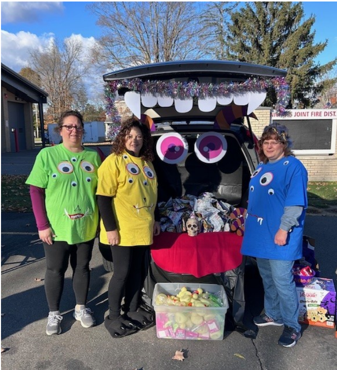
Photo: Nichols Fire Dept. Trunk-or-Treat