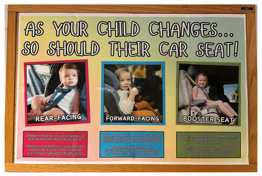
Bulletin Board: Health & Human Services Building, September 2024