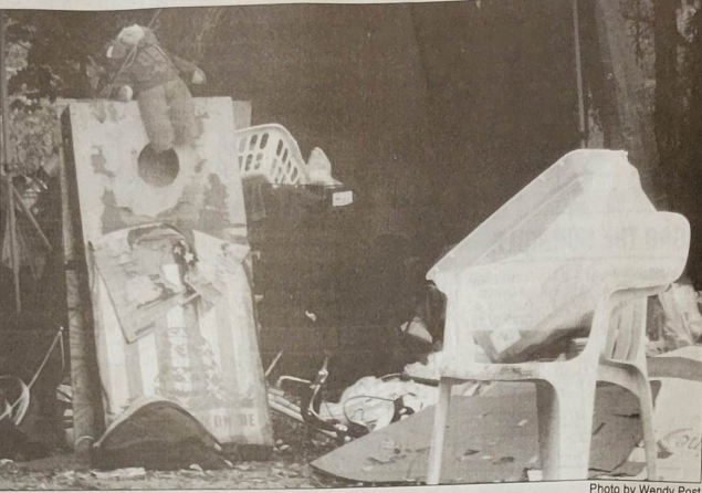
On Tuesday, Sept. 24, 2024, multiple agencies arrived at the Foundry Street homeless camp in Owego, NY. to post the property as a threat to public health, and to offer services and assistance to those residing there. A small handful of residents that aren't interested in county assistance were required to vacate in 24-hours.

structures on the site may be exposed to hazardous pollutants we acted immediately. We have been working with county officials and community partners to ensure resources are provided to individuals as they