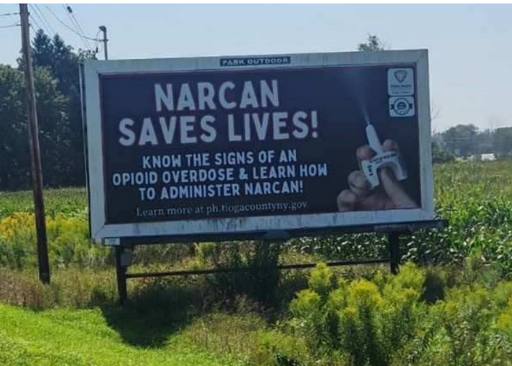
Billboard Design, Various locations, September 2024